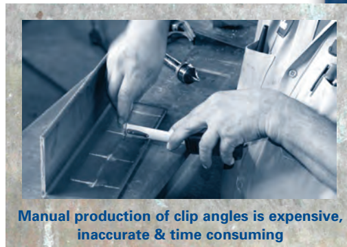
Manual production of clip angles is expensive, inaccurate & time consuming

And while many fabricators wanted a CNC angle line to speed up the process and reduce the costs, they seldom could afford to buy one.