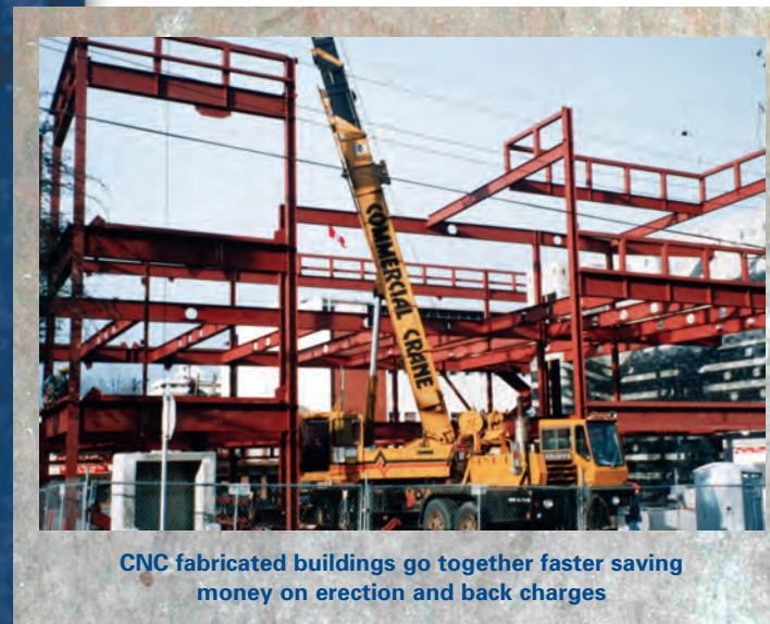
CNC fabricated buildings go together faster saving money on erection and back charges

So the end result is a highly accurate, very efficient and very affordable CNC angle line.