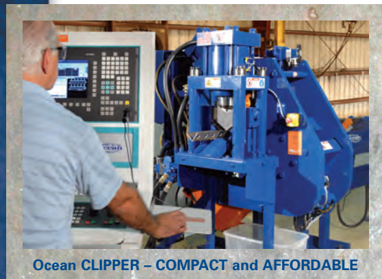
Ocean CLIPPER - COMPACT and AFFORDABLE

The Ocean CLIPPER is the most economical CNC clip angle line in the world. Similar machines are out of the reach of most small to medium fabricators, but the Ocean CLIPPER is extremely affordable. The fabricator only needs to run his machine a couple of hours each day and it will pay for itself in less than 12 months.