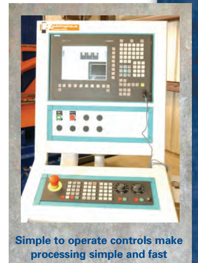
Simple to operate controls make processing simple and fast

The Clipper can be hardwired to your local network for easy access and importing of your detailing files.